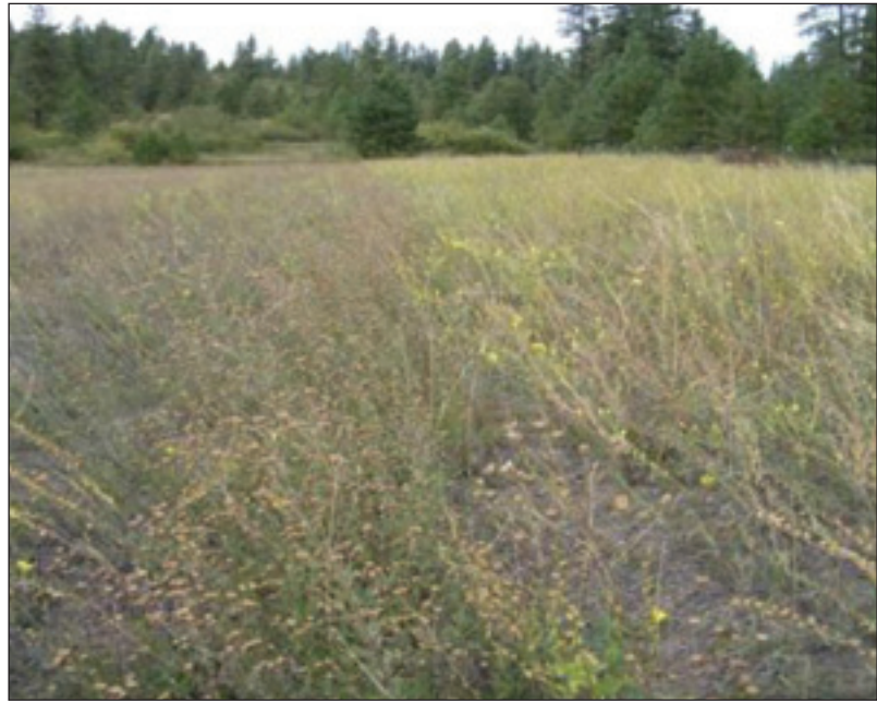
Figure 4. Effects of invasive plant removal without re-seeding. Spotted knapweed, the purple flowered plant on the left, has been replaced by Dalmatian toadflax, the yellow flowered plant on the right. The right side of the field had been treated with herbicides.

Only native grasses were seeded onto this site in 1998. Following the seeding, the area experienced a relatively wet year (128% of the 30-year average), while the next 3 years brought 79%, 90%, and 69% of average precipitation, respectively. Foliage production in this area was severely limited during this 3-year drought. Low organic matter soils and low precipitation during the early stages of grass recovery would have doomed a restoration effort focused at rebuilding a tallgrass prairie. However, the seed mixture used nine grass species whose moisture demands spanned a 500-mm rainfall gradient. The plant community that emerged (Figure 5) was dominated by a warm-season plant, salt sacaton ( Sporobolus airoides ), a species usually abundant only in alkaline or dry saline soils. To our knowledge, no such soils occur naturally in this area. Salt sacaton was solely responsible for about half of the vegetation cover. Other warm-season grasses common in mixed-grass and shortgrass steppe provided another 25%