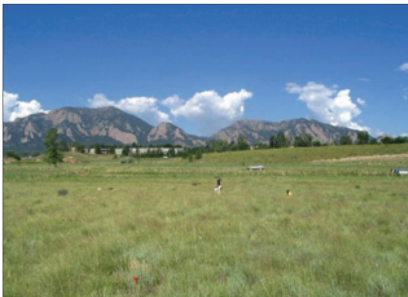
Figure 5. Revegetation site (foreground). What was a tallgrass prairie until the 1950s and then a gravel pit until the mid 1990s is now a mixed-grass prairie.

fact that traditional management approaches could not be used and/or were not likely to achieve management goals. In the first example, we have a novel management approach maintaining a highly desirable relict system which appears capable of persisting outside its HRV, and in the second example, the managers used an “uncertain climate seed mix” to generate a novel ecosystem that appears to be both drought and weed resistant.