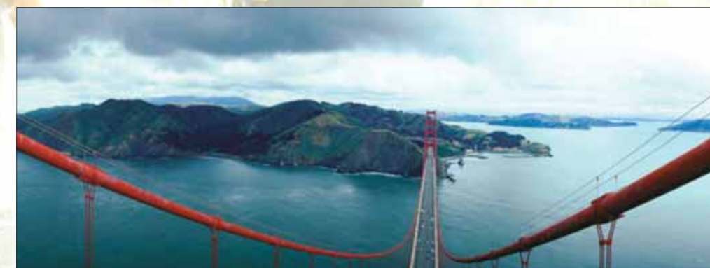
Looking north from the south tower of the Golden Gate Bridge towards the Marin Headlands

Hike the four mile Tomales Point Trail to view the native tule elk and witness a panorama of Tomales Bay, Bodega Bay and the Pacific Ocean. The trail is flat with some hills.