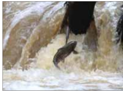
Salmon in Lagunitas Creek

Enjoy the birds that visit Rush Creek Preserve. Take a walk on the Pinheiro Fire Road to see an amazing variety of shorebirds and waterfowl that spend the winter here.