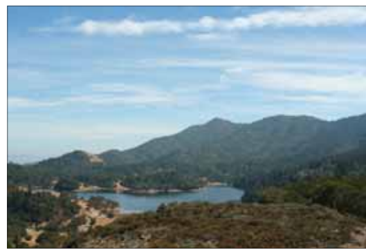
Bon Tempe Reservoir

Rodeo Beach is only a stone's throw from San Francisco and is a great spot for checking out the waves where the surf picks up in the winter.