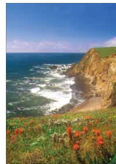
Indian paintbrush at Chimney Rock

Stay in the Marin Headlands hostel, ride the MUNI 76 bus to keep it car-free! If you do this on the first weekend of the month you can visit the NIKE site on Saturday and then hike up to Battery Townsley on Sunday!