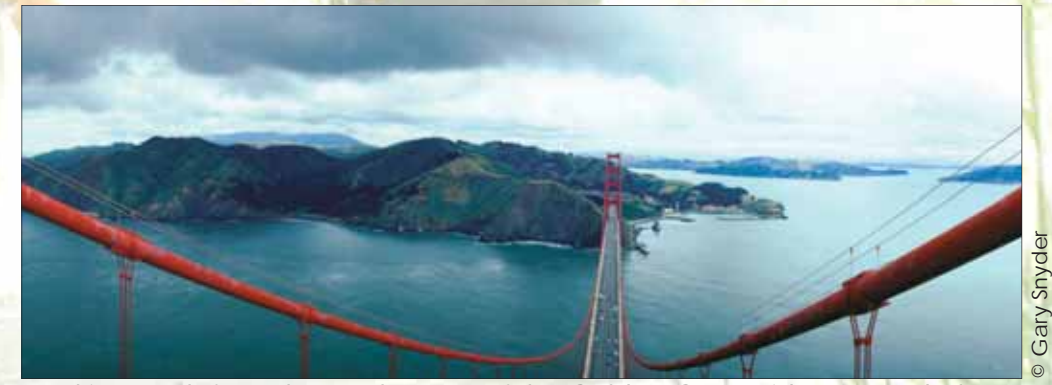
Looking north from the south tower of the Golden Gate Bridge towards the Marin Headlands

Hike the four mile Tomales Point Trail to view the native tule elk and witness a panorama of Tomales Bay, Bodega Bay and the Pacific Ocean. The trail is flat with some hills.