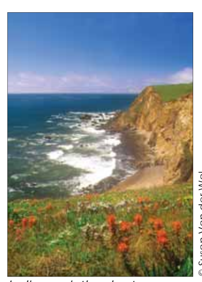
Indian paintbrush at Chimney Rock

Stay in the Marin Headlands hostel, ride the MUNI 76 bus to keep it car-free! If you do this on the first weekend of the month you can visit the NIKE site on Saturday and then hike up to Battery Townsley on Sunday!