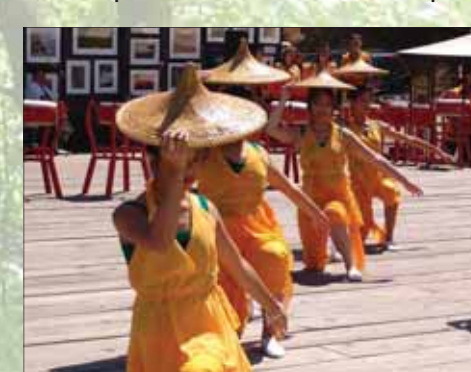
Young dancers during China Camp Heritage Day

Near the top of the Indian Tree Preserve is a dense redwood grove, catching fog and creating a cool oasis above the parched Novato landscape.