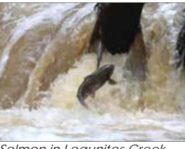
Salmon in Lagunitas Creek

View birds at Rush Creek Enjoy the birds that visit Rush Creek Preserve. Take a walk on the Pinheiro Fire Road to see an amazing variety