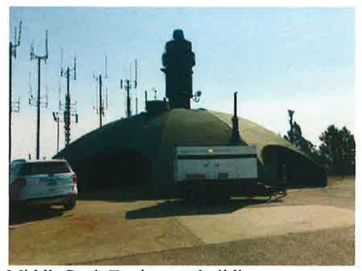
Middle Peak Equipment building