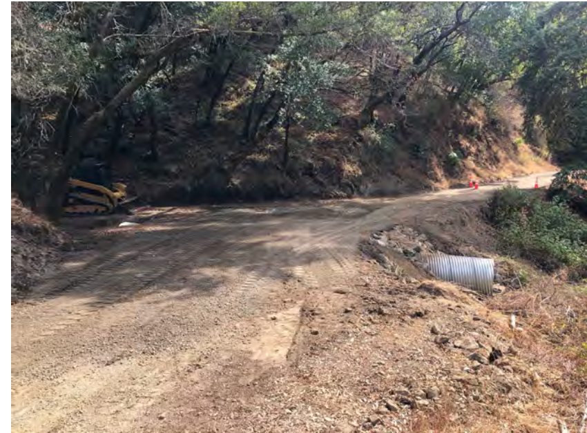
Bill Williams Fire Rd.