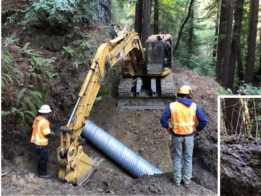
Fish Grade Culvert Repairs