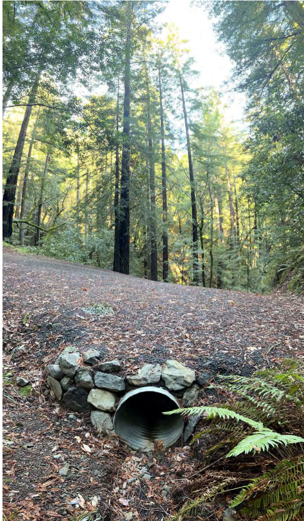
Fish Grade Culvert 14