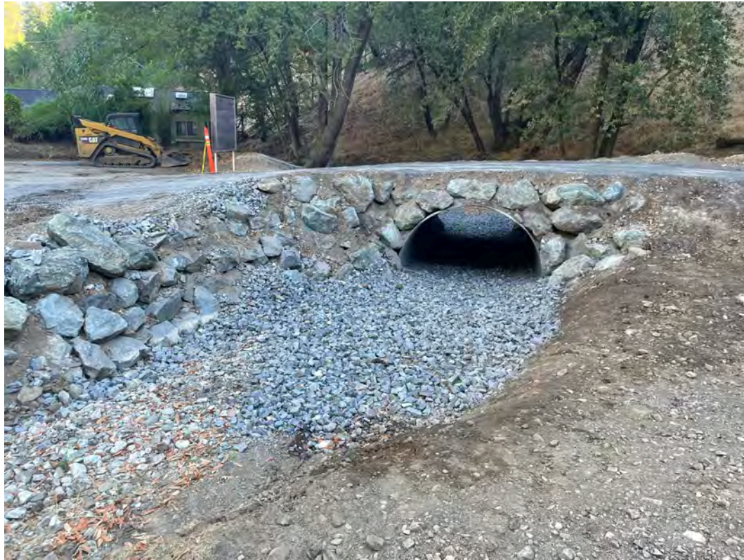
Marin Stables Culvert