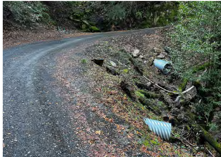
Fish Grade Culvert 15