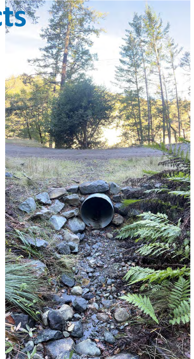
Alpine Bon Tempe Dam Road