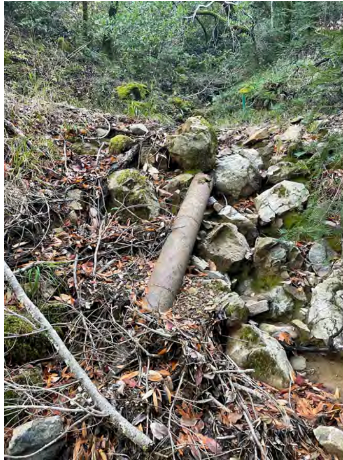
Eldridge Grade Culvert