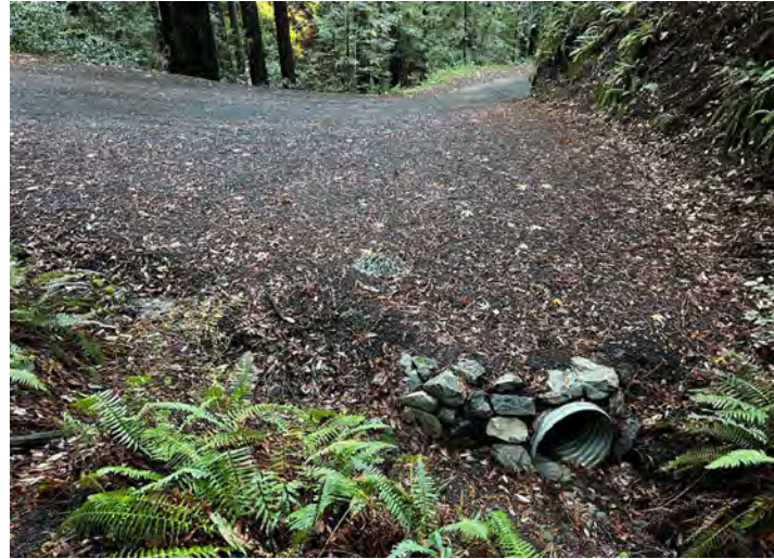
Fish Grade Culvert 13