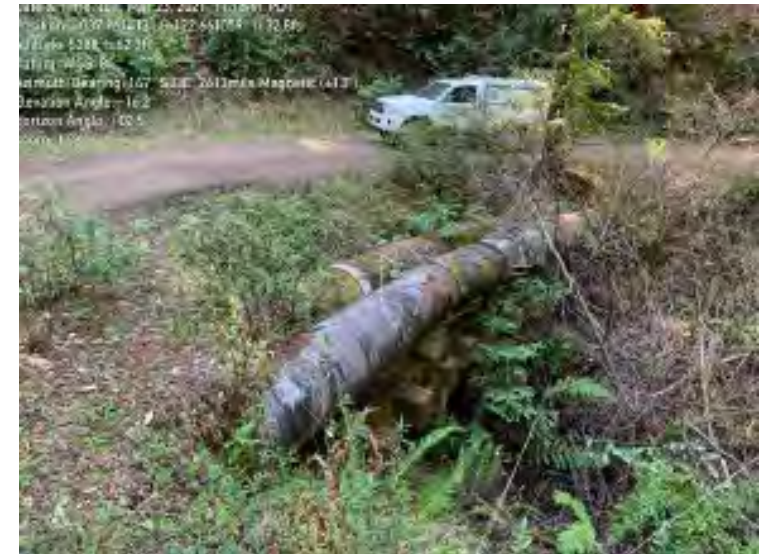
Kent Pump 27 Culvert