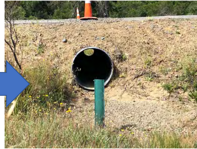
Sky Oaks Road