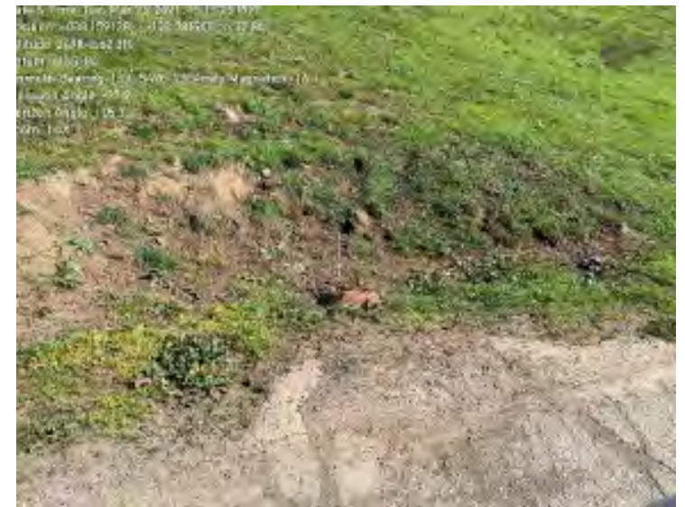
Soulajule 07 Culvert