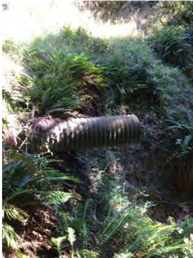
Old Railroad Grade Culvert